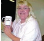
Treasurer To Be Determined